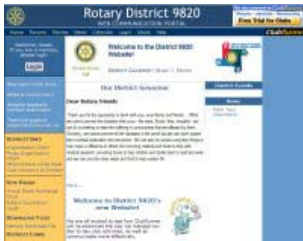
The District 9820 Website

As those who attended the district assembly will know we have a new website at