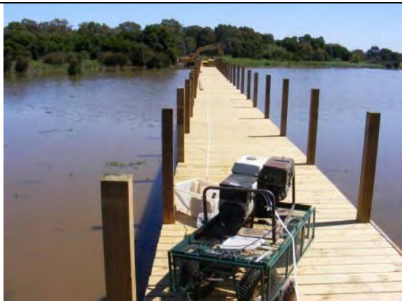
deck completed to 120m