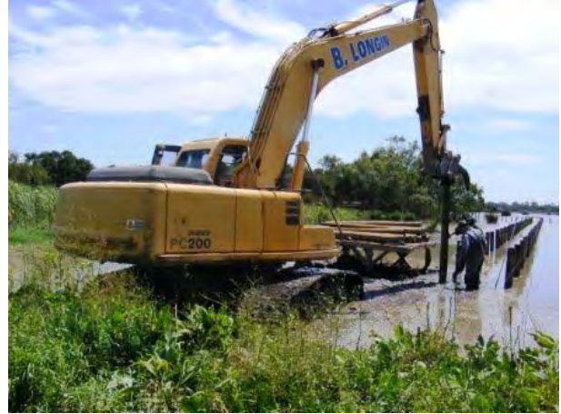
As at going to press Branco had nearly completed the driving the piles to connect with at grade trail to the Swing Bridge Drive