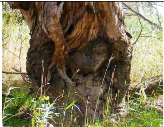
A marked tree discovered on the walk with Peter Synan. David and Alan possibly a blaze by McMillan in 1840?

NEXT MEETING Monday 26 th Australia Day Celebrations Port of Sale 8.30am see attached program