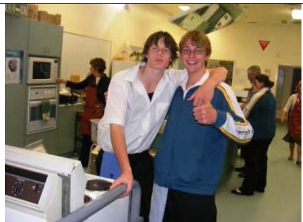
The students did a great job