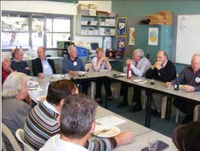
Back to School