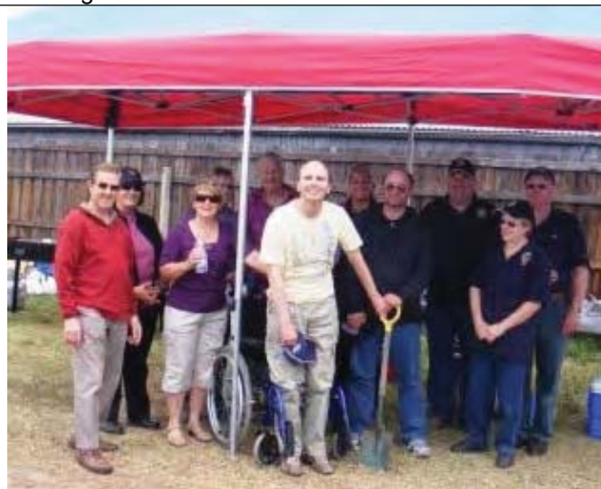
Members of the 5 Star committee following the turning of the sod by President Leo who had a dual role as Chairman of the 5 Star Committee

Sunday was the launch of the "5 Star Project", a housing project for disabled young people. Comprising ten residential units and shared community facility sponsored by the Club. The Club members present erected the tent prepared the BBQ and ensured that the sixty odd members of the public were well briefed on the project.