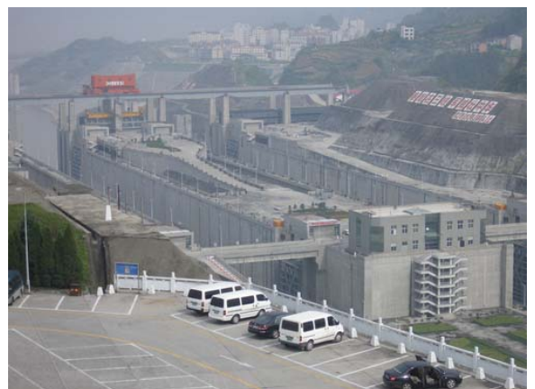
An overview of the Yangtze River Dam