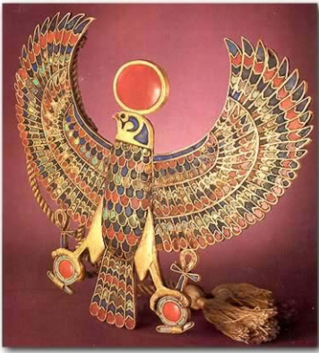
Gold Falcon pendant

Robert continued by giving some facts about the Aswan Dam. It was completed in 1970 at a cost of $1 billion and is the second largest dam in the world with a capacity of nearly 6 trillion cubic feet. The purpose of the dam is for flood control, hydroelectric power generation and irrigation. Despite the fact that only 3% of the land is arable, the dam has enabled Egypt, with a population of 80 million, to be self sufficient in food.