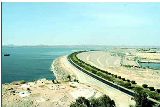
The Aswan Dam holding back the water of Lake Nasser

the Yangtze Valley supporting 600 million people.