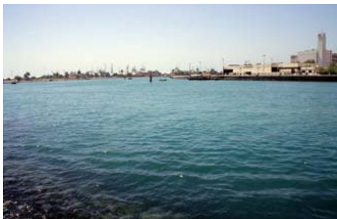
The Dubai Creek is noted for its golf course and yachting.