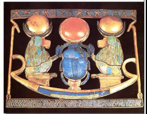
Pendant Depicting the Solar Beetle Flanked by Baboons